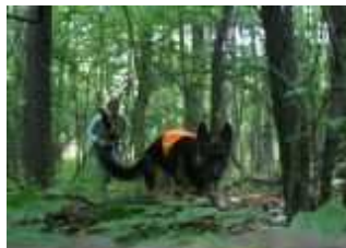
A training exercise with Skova