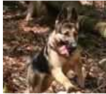
Zoe at 14 months old, closing in on a subject!

WNY SearchDogs, Inc. 885 Wheatland Center Rd Scottsville NY 14546